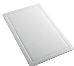
HDPE Chopping board 8657 001