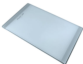
Glass chopping board 8631 300